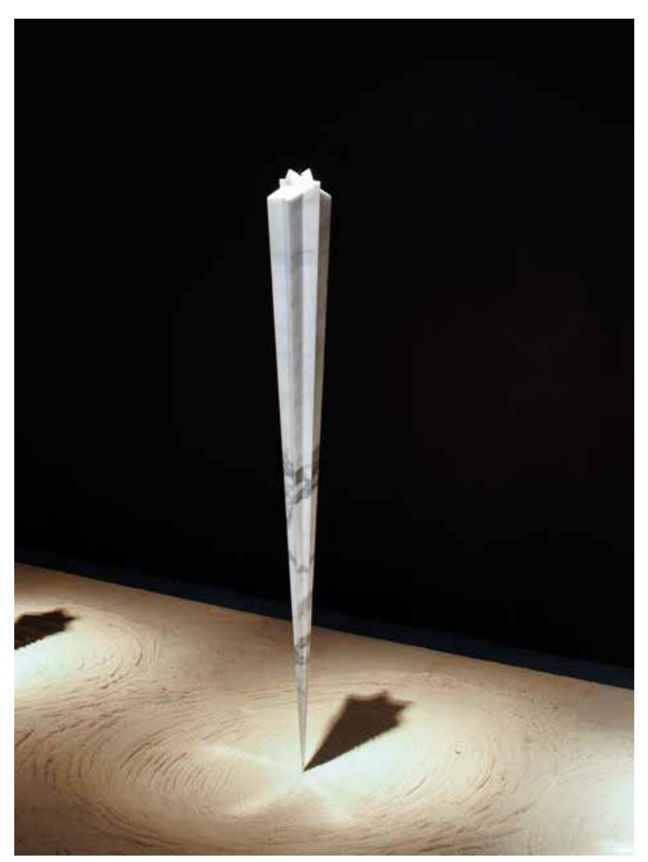
Pendulum No.9 by Ranya Sarakbi at SMOgallery